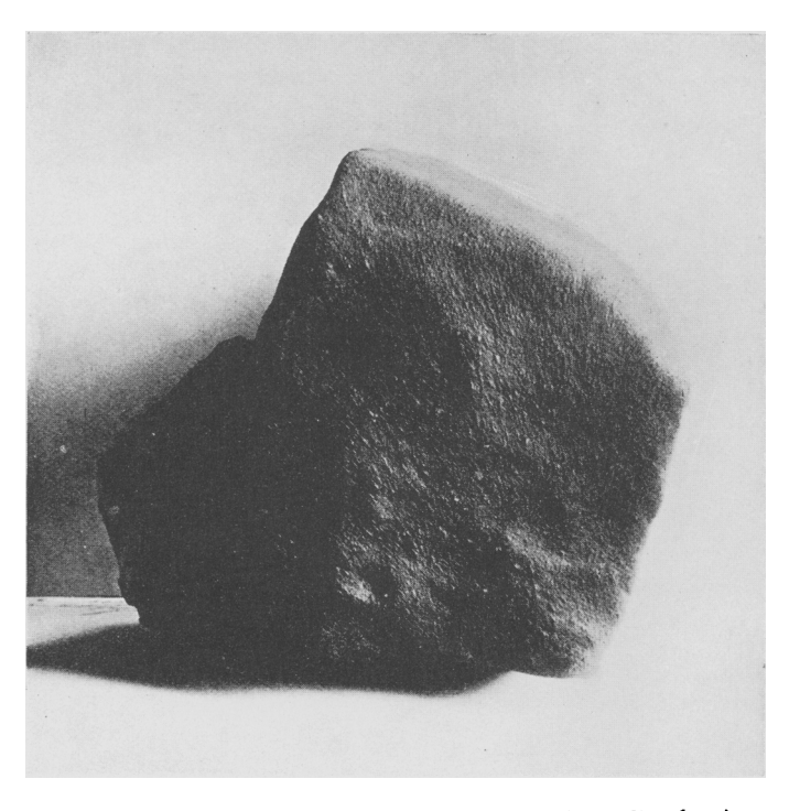
FIG. 2. Meteoric stone of Lake Brown, Western Australia, showing radiating flow-lines. \times \frac{1}{6} .

The analyses were conducted by the methods described in previous papers. In the attracted the cobalt was separated from nickel by means of a -nitroso- \beta -naphthol, and in the filtrate nickel was precipitated by dimethylglyoxime. Of the unattracted, a part weighing 5.9167 grams was separated by means of dilute hydro-