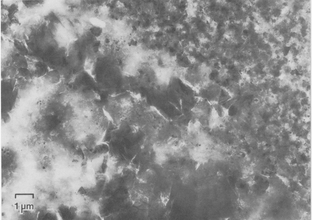
FIG. 2. Transmission electron micrograph (1 MV) of a region with variable grain size and mineralogy in the phyllosilicate matrix of the Cold Bokkeveld meteorite, initially prepared as a demountable extra-thin ( \sim 7 \mu\text{m} ) section.

the grain size and mineralogy changes significantly, which customarily leads to difficulties in obtaining good quality (i.e. fairly uniformly electron-transparent) ion-thinned specimens from sections of thickness \geq 30 \mu\text{m} .