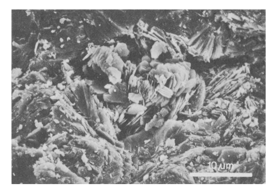
FIG. 1. SEM photograph of hydroxyl-bastnaesite-(Nd).

proximately 30 \mu m by 40 \mu m (fig. 1), a small cavity of crystals occurs within what appears to be a more massive body. The outside, apparently massive rim is composed of plates of bastnaesite so tightly intergrown and compacted as to appear massive. The cleavage surfaces and edges of the crystal stacks show, however, that they are built of plates. Within the cavity is a more open cluster of stacks of plates present in several orientations that illustrate the crystal habit and morphology. Many of the plates tend to be elongated. Because a wavelengthdispersive microprobe scan showed all of these crystals to be bastnaesite-(Nd), it is inferred that, despite differences in physical compaction and intergrowth, these are mineralogically the same.